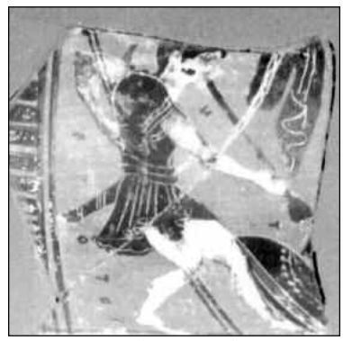
Epinetron fragment from the Museum at Eleusina

Various skill sets were required to play the different styles required of the instrument (much in the same way as today). Unlike an Olympic competitor, salpinx player in the army did not need to use the whole range of the instrument. Two notes were enough for a military bugler to play a wide range of sig-