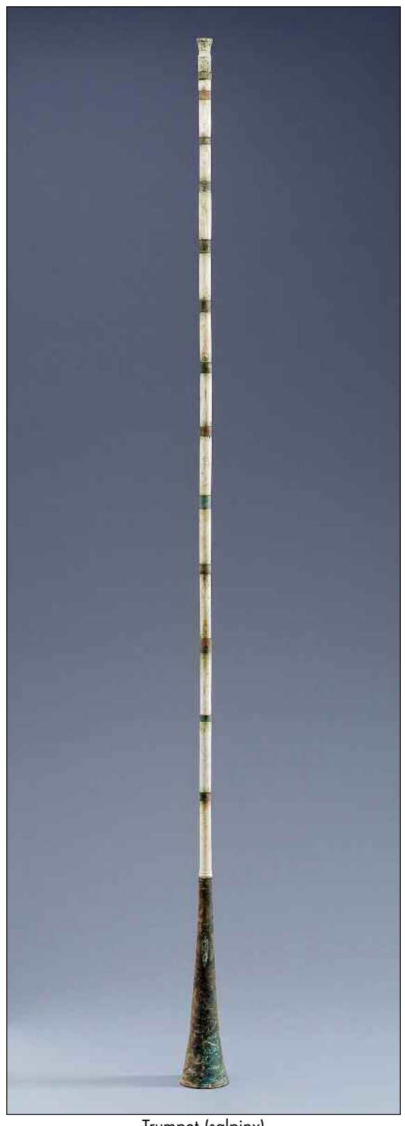
Trumpet (salpinx) Greek, Hellenistic or Roman Imperial Period, about third century B.C. to third century A.D. Bone with bronze ferrules and bell. Height x diameter: 155 \times 7.8 cm (61 x 3\% in.) Museum of Flne Arts, Boston, Frederick Brown Fund, 37.301.

We can, however, begin to place the instrument in an approximate time frame by comparing it with iconographic representations. Although many of the trumpets depicted in ancient Greek and Roman art appear to be relatively long, the majority of them also terminate with a cup-shaped bell, and do not appear to have tubing made in separate sections. But long trumpets with flared bells can also be seen occasionally, such as the one shown in a terracotta statue belonging to the Museé du Louvre in Paris (see illustration on page 44), which dates to the first century B.C. and depicts players of both a trumpet and an organ (hydraulis). A similarly proportioned trumpet is also included in a stone relief on Rome's Arch of Titus, dating to after A.D. 81. And yet another long trumpet with flared bell is shown in a Roman mosaic dating from the third to fourth century A.D., located at the Villa Romana del Casale in Sicily. Of further interest in this mosaic depiction is a thin structure (a chain, perhaps?), running along the upper side of the tubing and attached to upright "posts" near each end, which perhaps was used to cinch together multiple pieces of tubing for sturdiness.